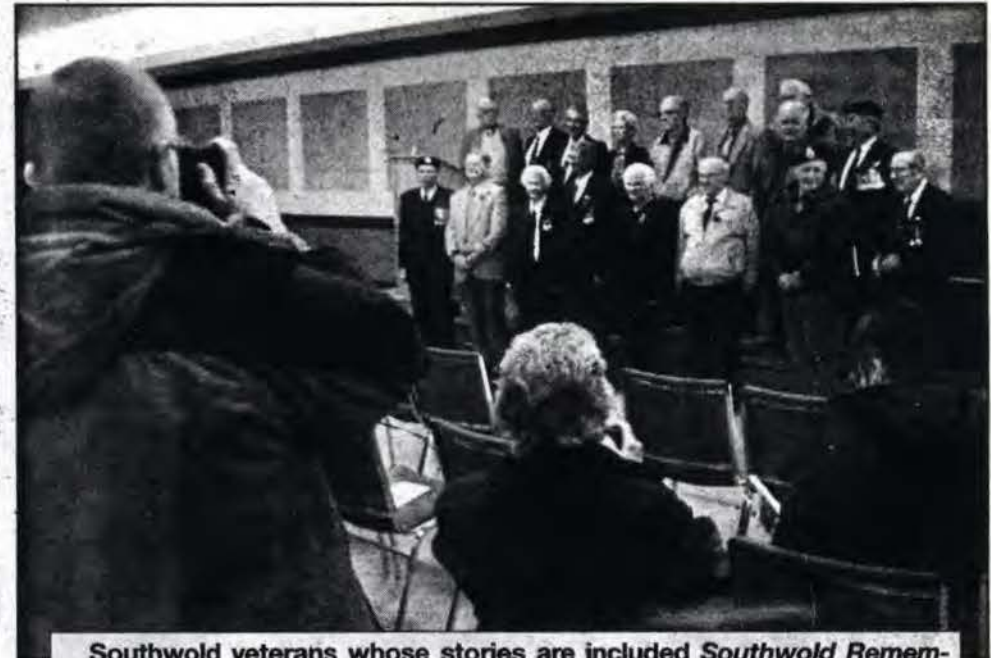
Southwold veterans whose stories are included Southwold Remembers ... The War Years , gather for photographs Saturday at the book's dedication.

To collect their memories, veterans were inter-